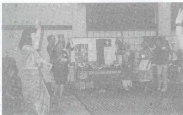
Thai dance demonstration