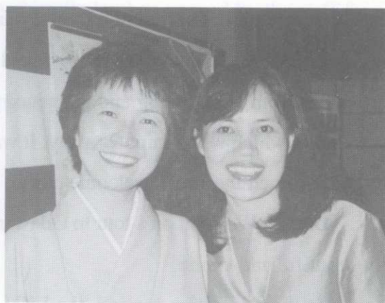
Kimono & Thai Costumes