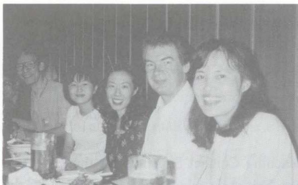
Night out in a restaurant downtown