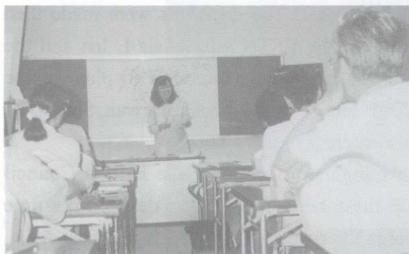
My presentation on process writing