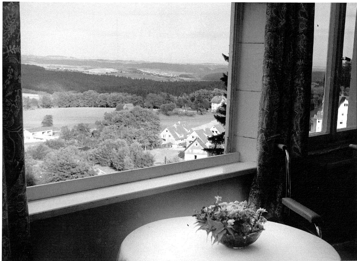
FREUDENSTADT, Germany, 11th August, 1961 - The view from Dr. Buchman's room of the Black Forest where, twenty-three years ago, he conceived the idea of "a moral and spiritual re-armament". On the table is a bowl of Swiss flowers he loved so well. On the right is his wheel chair.