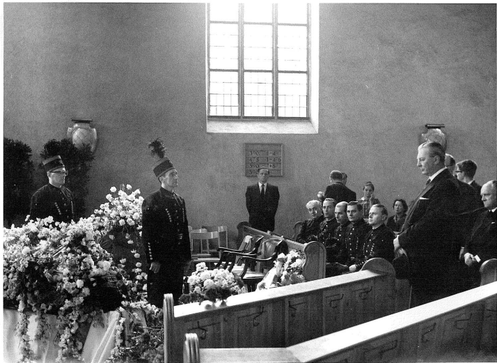
FREUDENSTADT, Germany, 11th August, 1961 - Minister-President K.G. KIESINGER, of Baden-Württemberg, stands in silent tribute before Dr. Buchman's coffin in the City Church, where traditionally costumed German miners stand vigil with lighted lamps.