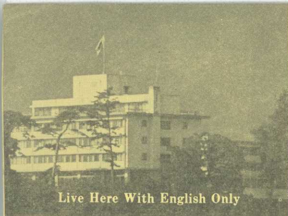
Live Here With English Only