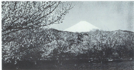
Mount Fuji, seen from Odawara